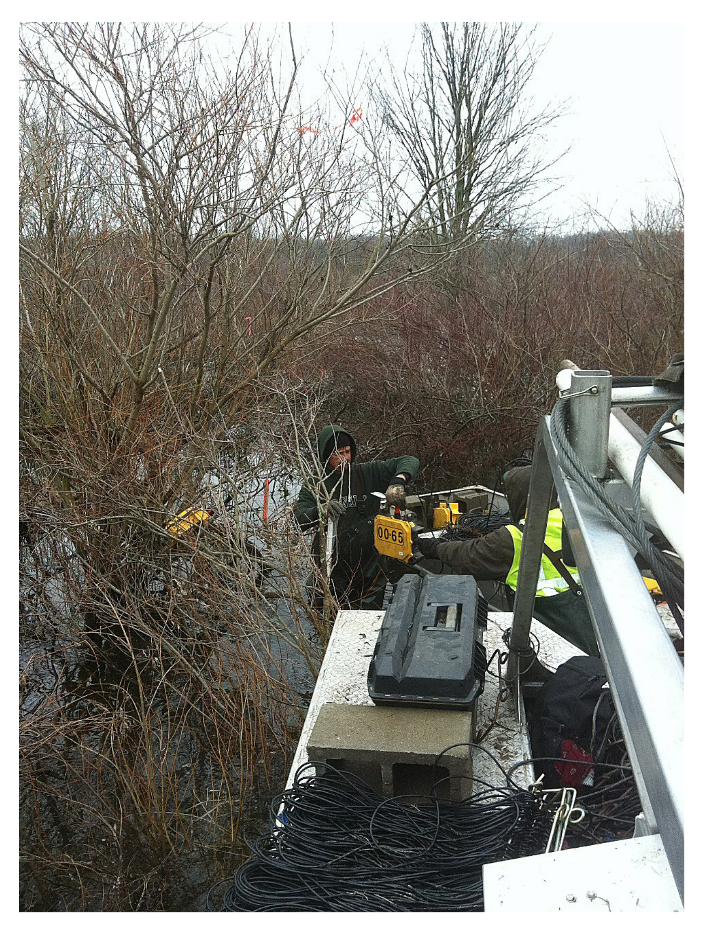
当前,无线采集技术在被物探行业认可的同时尚存在几点疑问,例如其是否能彻底摆脱有线采集系统的缺陷。其中大家一致认为的一个主要问题便是关于设备的重量。当采集项目遇到一些不正常的道间距和检波器类型的组合时,相比无线采集系统,有线设备地震队的装备重量总是变的更重。(如对此有质疑,可查阅在 2010 年 6 月出版的"地震波初至"杂志中发表的一篇题目为:"权衡无线和有线采集系统未来在陆上地震采集中扮演的角色"的文章,并可自行进行数学计算)。但是在采集项